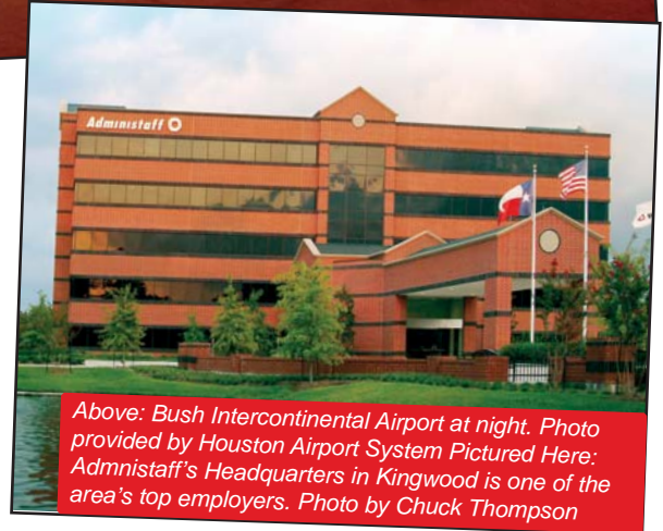
Above: Bush Intercontinental Airport at night. Pictured Here: Administaff's Headquarters in Kingwood is one of the area's top employers.